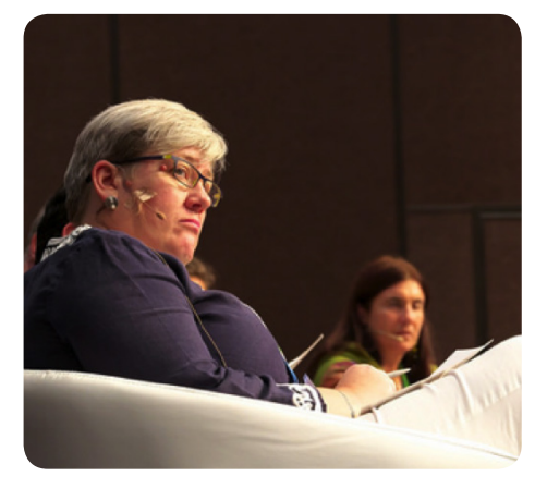
"This is one of the more interesting things I'm going to be doing for all of the COP."

While branded a youth session, with the over-arching aim of discussing the key conference themes from the perspective of youth, we also had a strong emphasis on intergenerational learning. We actively encouraged senior professionals to participate in the discussions and to consider the perspectives and challenges facing young people. Effective youth participation depends on the mentorship and support of senior professionals, so it's important they are part of the conversation and are actively encouraged to support young people and take up their perspectives.